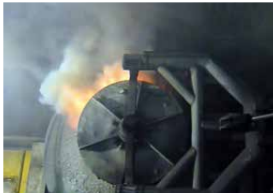
Traditional smelting furnace

Funded by the IPO proceeds plus a USDA-backed loan, we broke ground on our 135,000 sq. ft. aqua-refinery in Tahoe Reno Industrial Park in August 2015 and had the facility outfitted and commissioned by June 2016.