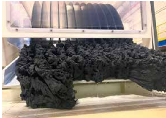
Electrolyzer output, ultrapure lead

I was really interested in commercializing the technology, so I invested in the company and became the chief commercial officer in Jan. 2015, and we had the IPO in June. I then developed a relationship with Interstate Batteries where they would supply batteries for recycling (feedstock) and with Johnson Controls Power Systems (JCI), now called Clarios as a first-mover partner. Both companies invested in the company, and Interstate contracted to provide the feedstock, while Clarios contracted to buy the recycled lead and had the rights to use the technology in their own facilities.