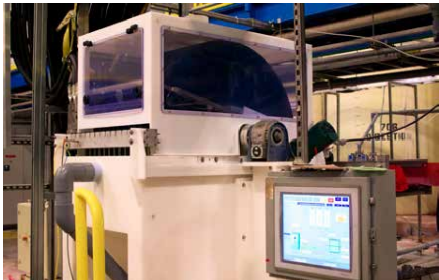
Aqua Metals electrolyzer